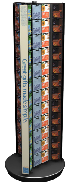
144-peg Tower Spinner