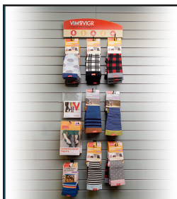
WALL SLAT SET Sign H: 6 in | W: 19 in Minimum order 72 pairs *Hooks & pegs not included