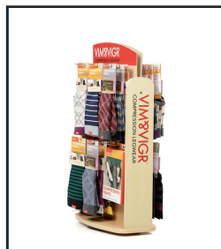
TABLETOP SPINNER Sign H: 32 in | W: 9.5 in Minimum order 72 Pairs