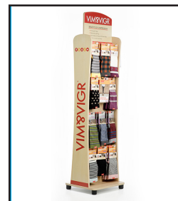
FLOOR DISPLAY Sign H: 75 in | W: 18 in Minimum order 108 Pairs